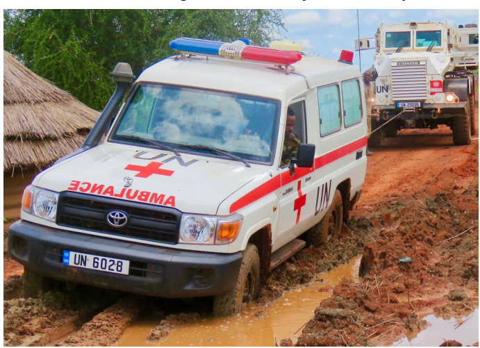
UNMAS Casspir vehicle coming to the rescue of a UN ambulance

The UNMAS Integrated Road Assessment and Clearance Teams (IRACT) remobilized by the end of September, after the rainy season stand down period.