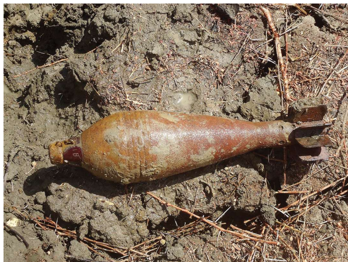
An example of 82 mm mortar

The two informants who live in the area where the explosive device was found, expressed their gratitude to UNMAS and UN police for their prompt response. Once the demolition task was completed, the team informed Mr Bol Deng, one of the informants, that the threat had now been eliminated.