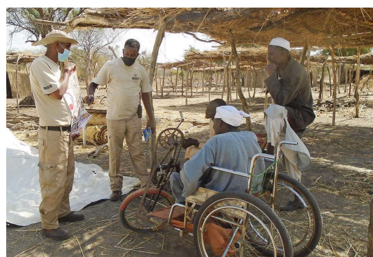
Non-technical survey in Um Khariet