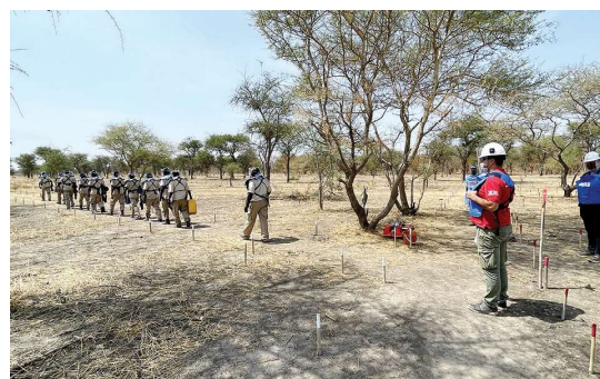
Quality assurance visit to Koladit minefield