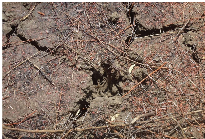
Explosive hazard reported by the local community members