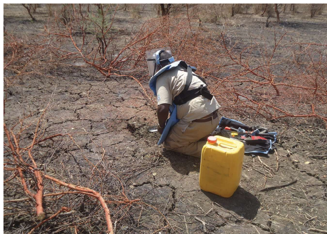
Excavation of the hazard