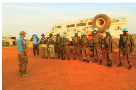
Ground monitoring mission at TS-21