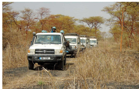
Route assessment convoy returning from Hedid