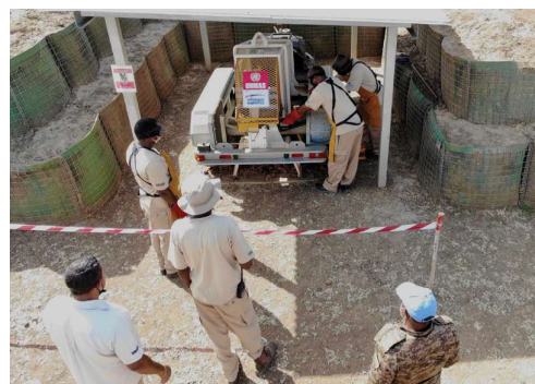
Destruction of confiscated weapons in Dukra

7 assault weapons confiscated by UNISFA and destroyed by UNMAS