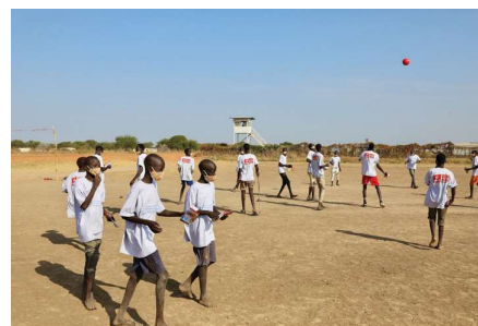
Risk education with children through sports activities