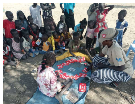
Interactive risk education with children