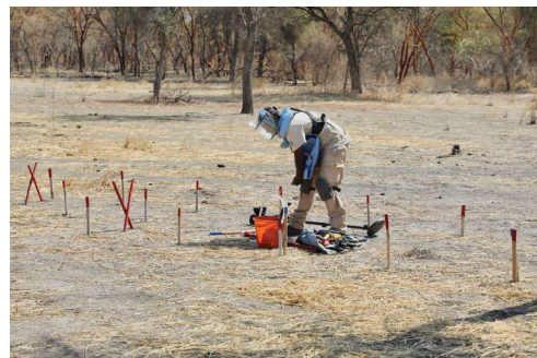
Manual mine clearance in Makir