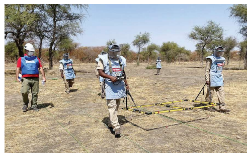
Accreditation in progress

3,021 m 2 of land assessed as safe from explosive hazards