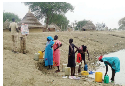
Lifesaving risk education messages to a group of women