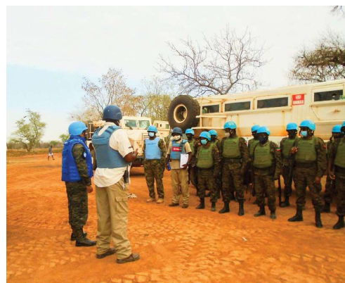
Ground monitoring mission at TS-21

109 explosive ordnance risk education sessions