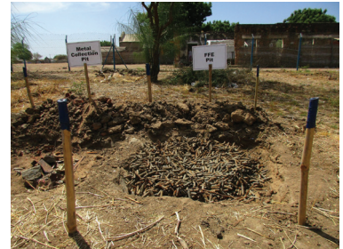
Metal collection point

Muhammad Salahuddin, IOM Programme Officer says: "We at IOM are grateful for the UNMAS prompt response, who adopted an expedited approach to complete the task in a very short time to our utmost satisfaction. This has enabled us to implement our activities at the Vocational Training Centre. The place is now safe, and we are planning to provide various vocational trainings to 100 youths within this year that will help in improving the livelihoods and income generating abilities of the Abyei youth. Since IOM is engaged in many infrastructure activities, we look forward to similar support and cooperation from the wonderful UNMAS team, to make secure our working and service delivery environment."