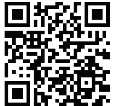
Scan for more information about UNMAS Abyei

IF YOU SEE AN ITEM OF CONCERN, DO NOT TOUCH IT!