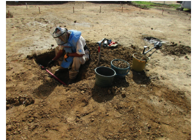
BAC clearance at the VTC in Abyei