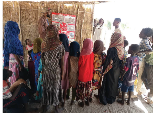
Explosive Ordnance Risk Education session in Goli