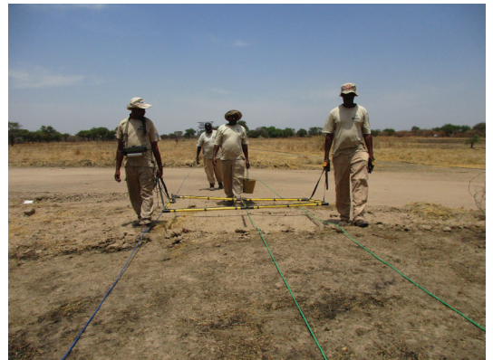
Battle Area Clearance