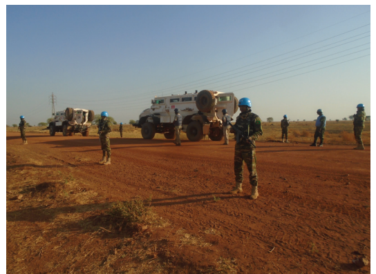
Ground Monitoring Mission in Tishwin