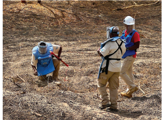
UNMAS monitoring visit