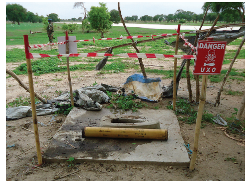
One of the explosive devices found in May

NO CASES OF COVID-19 WITHIN UNMAS-UNISFA TEAM IN ABYEI