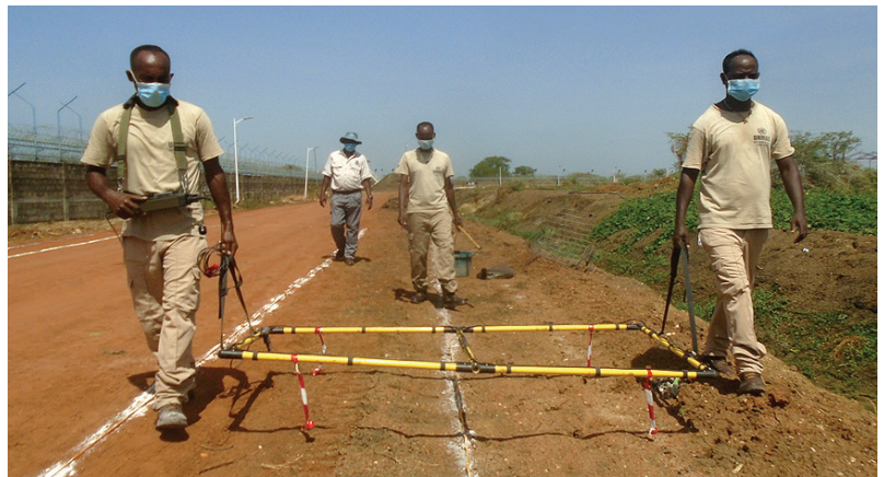
UNMAS team conducting refresher training

Team medics conduct health checks and record them on a daily basis. Every team member has been issued with adequate cleaning equipment such as hand sanitizer, liquid soap, individual brooms, mop, bucket, disinfection materials to ensure self-sustainability. While adopting the COVID-19 mitigation measures, the teams continue to maintain their operational readiness to deploy on any upcoming emergency tasks. UNMAS teams further undergo periodic inspection on serviceability of tools, equipment and vehicles; continuous refresher trainings; and physical and mental wellbeing assessments of individuals.