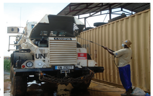
Regular maintenance of Casspir (mine protected vehicle)

4 PATROL SUPPORT TEAMS OPERATIONAL, ON STANDBY FOR GROUND MONITORING MISSIONS (GMM) AT FOUR TEAM SITES