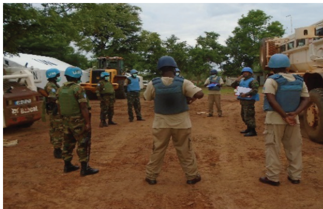
Social distancing imposed by UNMAS teams during briefings

Each morning before embarking on the patrol, all members have their temperature checked by the UNMAS PST medic, as a means of containing the spread of the virus. If any patrol team members show a high temperature or flu-like symptoms, they are not allowed to go on the patrol. All members have their hands sanitized when boarding the vehicles, not only at the start of the patrol, but also whenever the team stops during the patrol. It is also mandatory that all members wear face masks at all times during the patrol. Before each patrol, the UNMAS PST medic briefs the patrol members on the COVID-19 pandemic mitigation measures and necessary actions for reducing the spread of the virus.