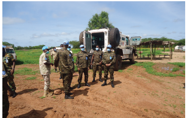
UNISFA delegation & UNMAS team members after disembarking the CASSPIR MPV near Diffra

Mine action entails more than removing landmines from the ground. In addition to the regular mine action activities, UNMAS teams enhance the safety and security of peacekeepers through a variety of additional actions, including the disposal of weapons and ammunition confiscated by UNISFA troops, delivering risk education to UNISFA personnel to enhance their knowledge of safety practices, and deployment with the JBVMM teams to conduct safer ground patrols in the Safe Demilitarized Border Zone.