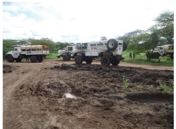
Difficult road conditions throughout the Abyei area require extended driving skills for CASSPIR drivers