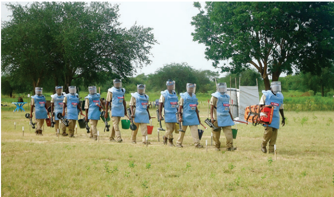
Deployment to the minefield (training)

As per the yearly UNMAS-UNISFA plan of operations, the UNMAS Integrated Clearance Team (ICT) and two Integrated Route Assessment and Clearance Teams (IRACTs) concluded remobilisation and refresher training following the contractual stand-down for the rainy season. After the completion of training, UNMAS conducted a provisional operational accreditation of the teams, ensuring their full operational readiness as of 1 November in support of UNISFA's dry season deployment plan.