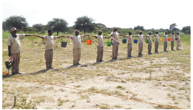
Battle Area Clearance (BAC) Visual Search (training)