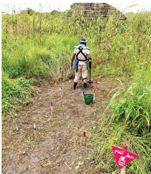
Manual Mine Clearance (training)