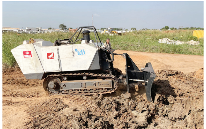
Mechanical Demining Machine Training