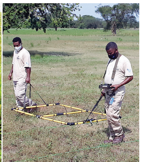
Battle Area Clearance - Large Loop (training)