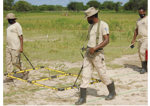
Clearance Teams Refresher Training and Reaccreditation

UNMAS clearance teams have remobilized and completed refresher training and received provisional operational accreditation in accordance with contractual requirements and are ready for dry season deployment as of 1 November in support of the UNISFA dry season deployment plan.