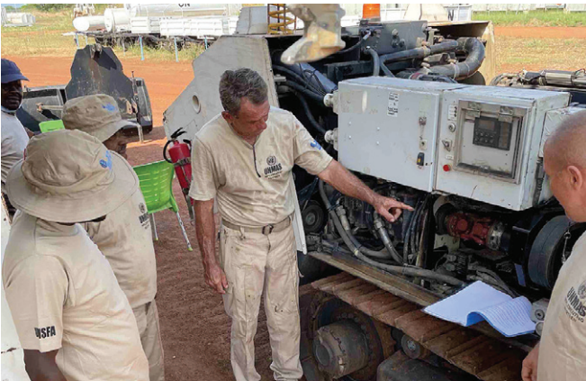
Mechanical Demining Refresher Presentation