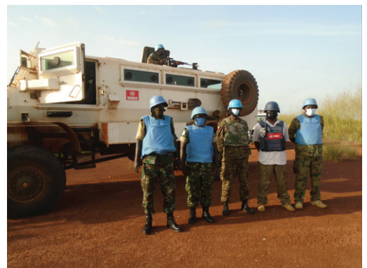
Ground Monitoring Mission at TS 21 Tishwin

JBVMM Ground Monitoring Missions supported