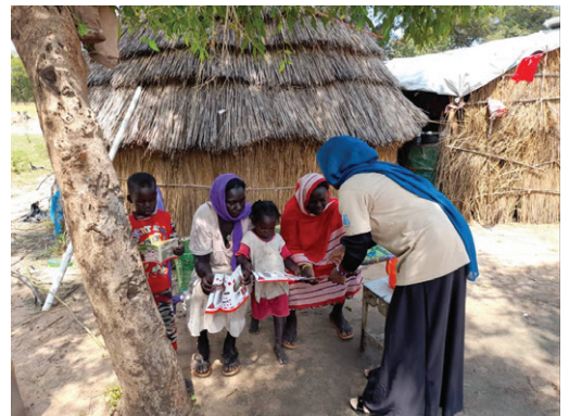
Explosive ordnance risk education in northern Abyei

Explosive Ordnance Risk Education sessions