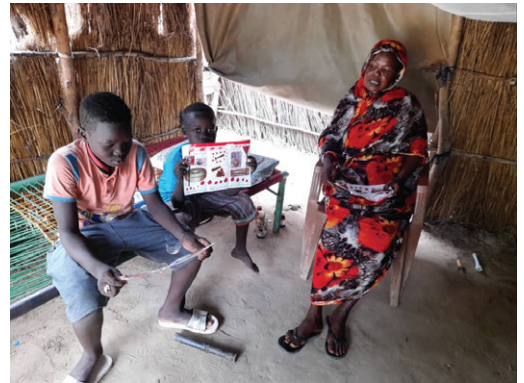
Explosive ordnance risk education in southern Abyei