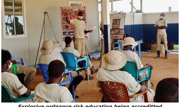
Explosive ordnance risk education being accreditted