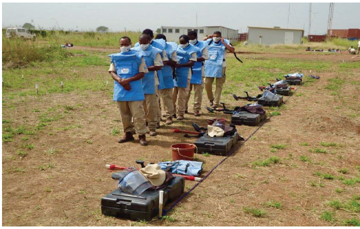
Clearance team prior accreditation process

This year, the major challenge faced by UNMAS was the timely remobilization of teams in light of the COVID-19 travel restrictions and requirements. UNMAS was able to address this challenge through careful planning and coordination with UNISFA, resulting in the successful remobilization of all teams in time for training and accreditation.