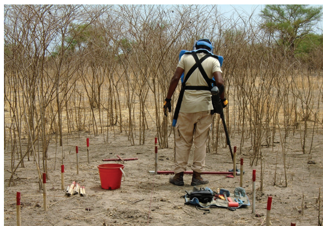
Manual mine clearance in Koladit

1,142 Men, women, girls and boys received Explosive Ordnance Risk Education