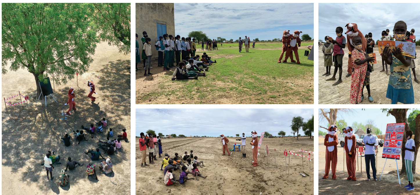
Photos of the drama events as well as distributed comic books and leaflets

The last step in this innovative approach to EORE, and perhaps the most tangible, has been the organisation of local drama group plays in Abyei Area, primarily for children in schools and local communities, which feature the foxes in the comic book acting out the story. The first drama plays were organized in April in the southern part of Abyei. The plays will run up until end of June. UNMAS also decided to mainstream its gender perspectives, by ensuring equal number of male and female actors was involved into the plays.