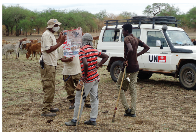
Non-technical survey in Luki