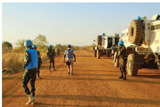
Ground monitoring mission

16 UNISFA military and civilian staff received safety training