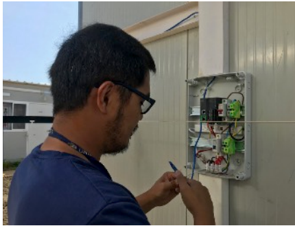
WAN Technician configures and sets up PLC for FRIM