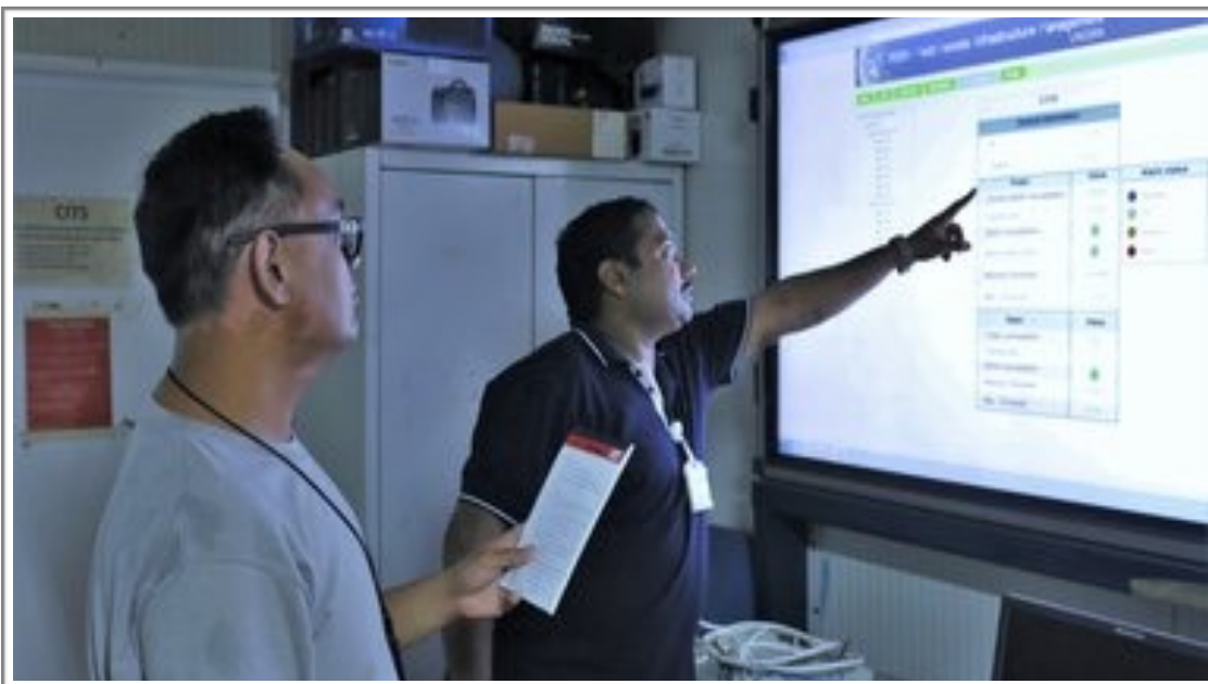
UNISFA Technicians monitor the UPS output from FRIM interface. Information such as phase variance, output and other information regarding the UPS is closely monitored via FRIM.