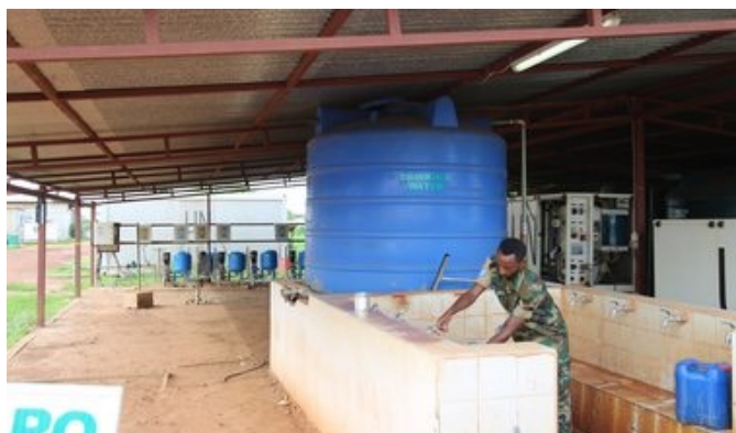
UNISFA in Abyei main water point