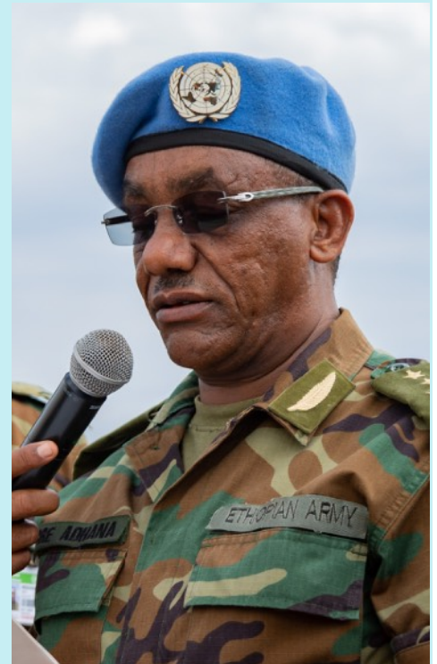
UNISFA Acting HoM and FC delivering the UNSG message on UN Day