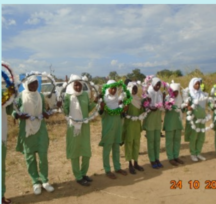
Community presentations during the UN Day celebration in Diffra held on 24 October