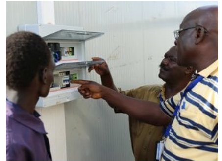
Engineering Team installs PLC with Power and Water Meters

UNISFA, through the strong engagement of the Chief of Mission Support, is piloting the project with phase one managing power and water consumption to accommodations and offices.