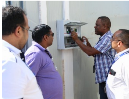
FRIM PLC is examined by FTS Infrastructure and Network Team