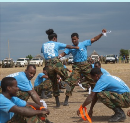
Ethiopian Commandos presentation (left); Abyei school children with UN day banner (right)