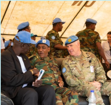
UNISFA senior leadership joined the UN Day celebration on 24 October in Abyei

Every day, the women and men of the United Nations work to give practical meaning to that Charter. Despite the odds and the obstacles, we never give up. - UNSG Antonio Guterres