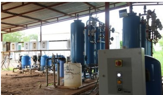
Water facility distributing potable water to the whole

It took a couple of weeks to identify the meters and interfaces to provide data to the platform hosted in Valencia. The first phase of the pilot project was to be completed by also pulling data from end-users.